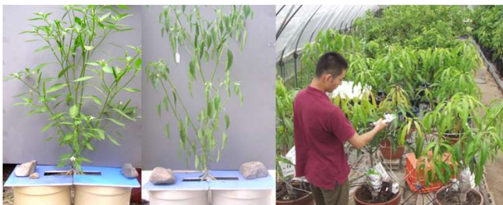
Chili plants with separated roots Left : half roots waterlogged Right: whole roots waterlogged