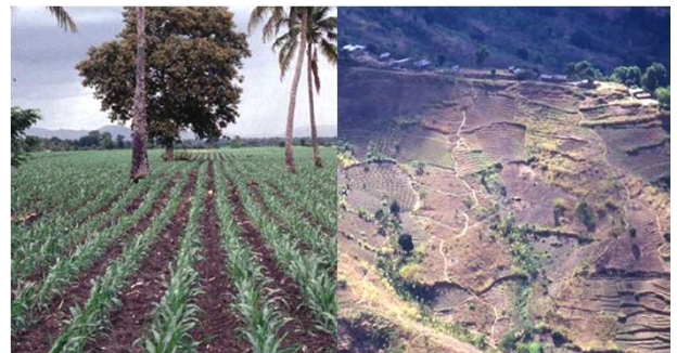
Left : Maize cultivation in Thailand Right: Slope land agriculture in Tanzania

In order to realize sustainable agricultural production, it is important to use appropriate agricultural technologies harmonized with the local environment. For this purpose, it is indispensable to understand local agricultural resources and present and past farming systems. We are studying and evaluating agricultural resources and farming systems through field surveys and experiments.